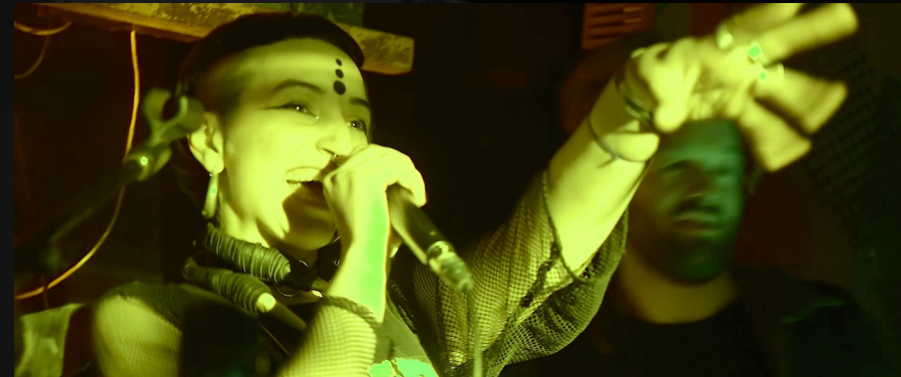
JUMAN x SNED 'SING FOR ME' @ WORLD BEYOND