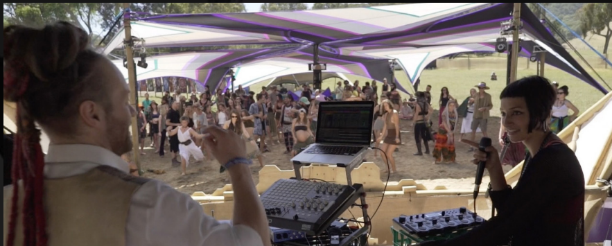
JUMAN x SNED 'BREATHE' Live @ Tanglewood